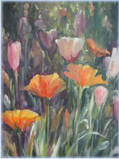
Acrylic Painting - Cheryl Whitestone instructor