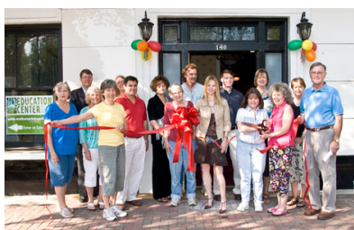
The Guild's new Education Center was opened with a ribbon cutting ceremony on Sept. 3rd.

Here are some photographs of current Guild events.