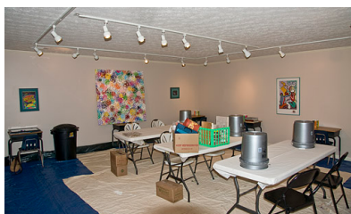
The current classroom can accommodate about 20 students.