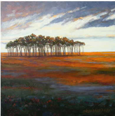
Painting Outside Your Comfort Zone - Carol Rainey Fox instructor