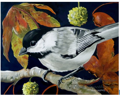
Birds of a Feather: Painting Bird Images in Large Format - Paula Lansford instructor